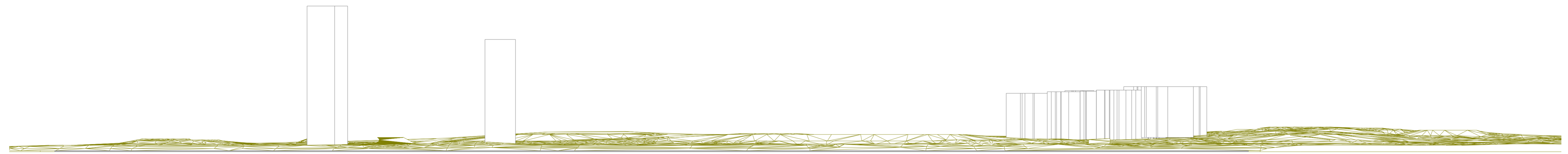
Section at Brisbane River - aligned with Montague Road